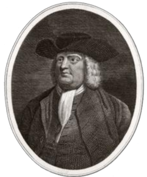
Portrait of William Penn

The Quakers believed in religious freedom and did not believe in religious rituals or ceremonies. They were very peaceful and did not fight in wars or believe in slavery. Penn wanted to create a colony that was not just for Quakers, but was free for all who chose to live there. He wanted to live in peace with the Native Americans and bought land from the Lenni Lenape Indians that lived there. He wanted everyone to live fairly and peacefully, no matter what church they attended.