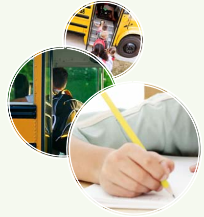
Textbooks and Instructional Materials List

The District has affirmed that each pupil, including English learners, have their own textbook to use in class and to take home.